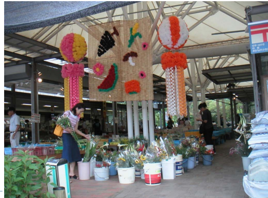
Direct sales shop of agricultural products