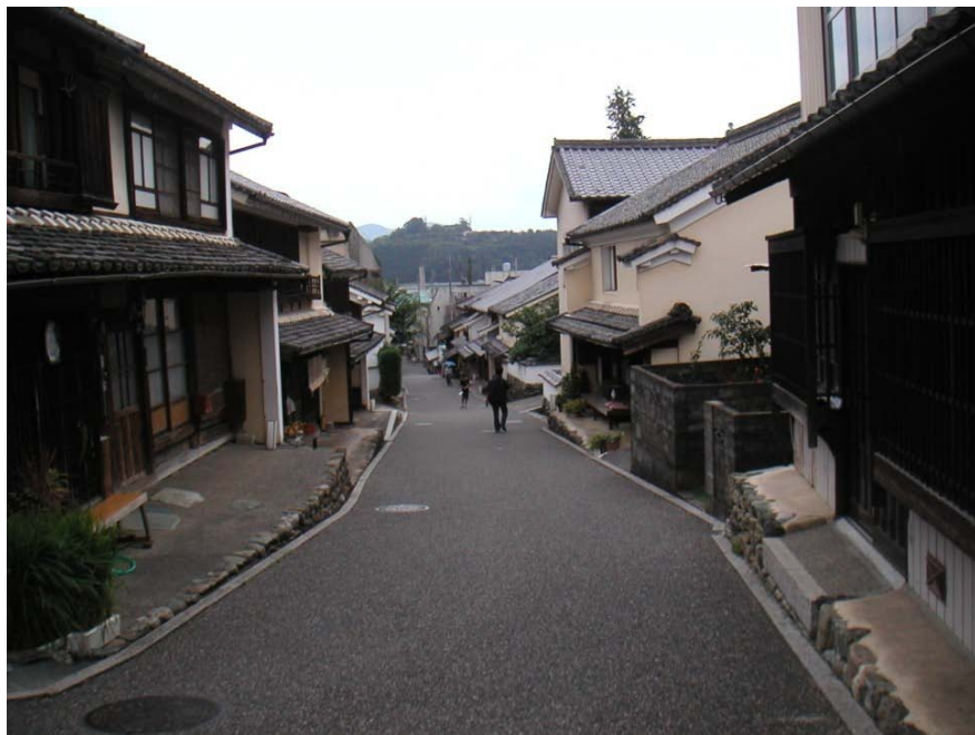
Conservation of Historic Town Center