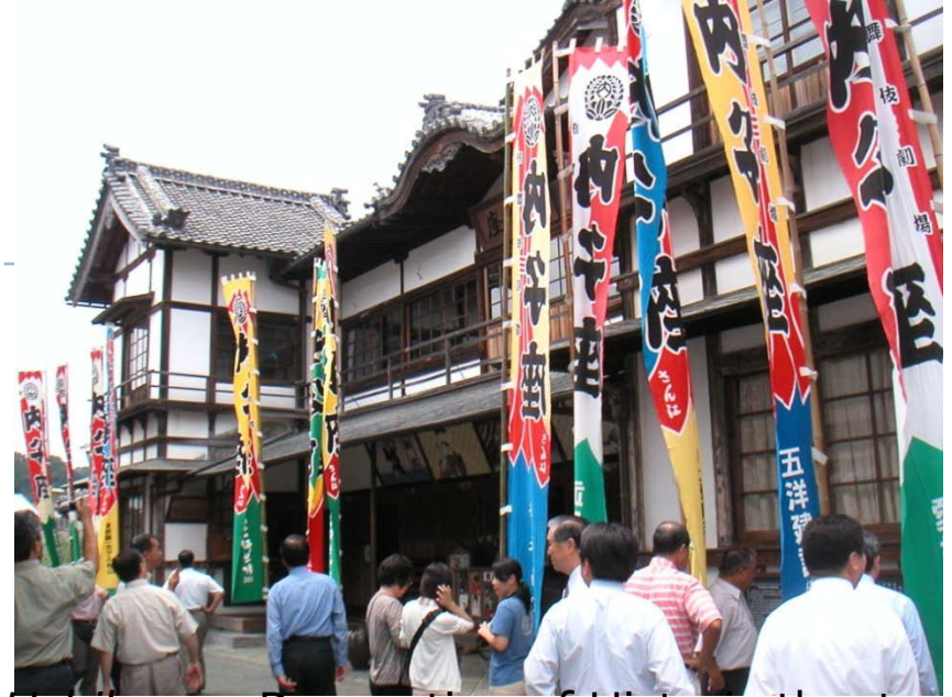
Uchiko-za, Renovation of Historic theater

Conservation of town center and fostering rural-urban functional linkage Uchiko Town, Japan